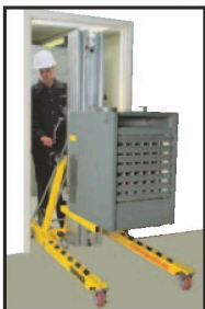
Fits through doorways!

Lockable 5" Casters Hard tread urethane wheels with Delrin® bearings.