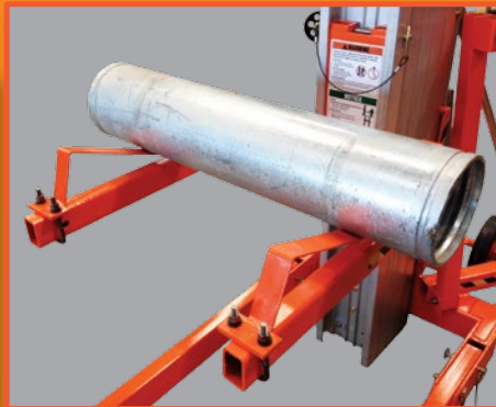
Pipe Rack Attachment