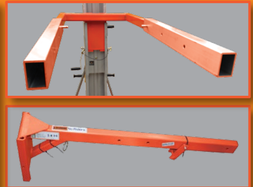
Fork Extension & Jib Attachment