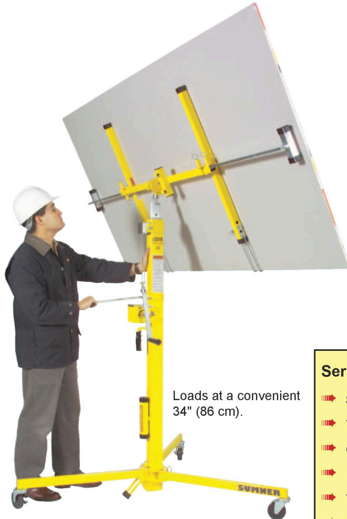
Loads at a convenient 34" (86 cm).