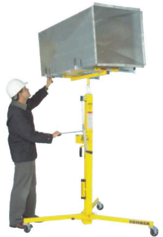
Optional HVAC/ Light Cradle Part No. 784474