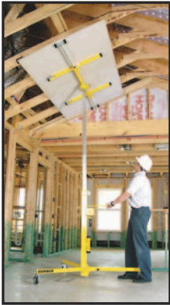
Cradle tilts up to 45° for cathedral ceilings.