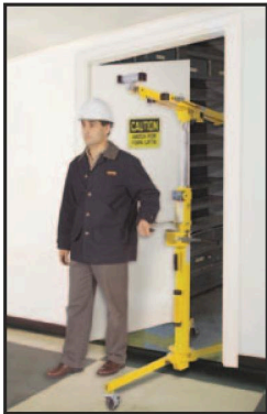
Fits through doorways!