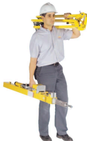
Lift conveniently disassembles for easy transport. Convenient carrying handle!