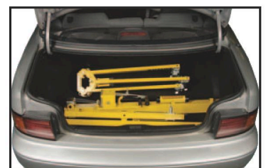
Fits in a car trunk!